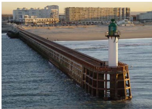
“Tillac” on the Calais pier – Design by Bois et loisirs (France).